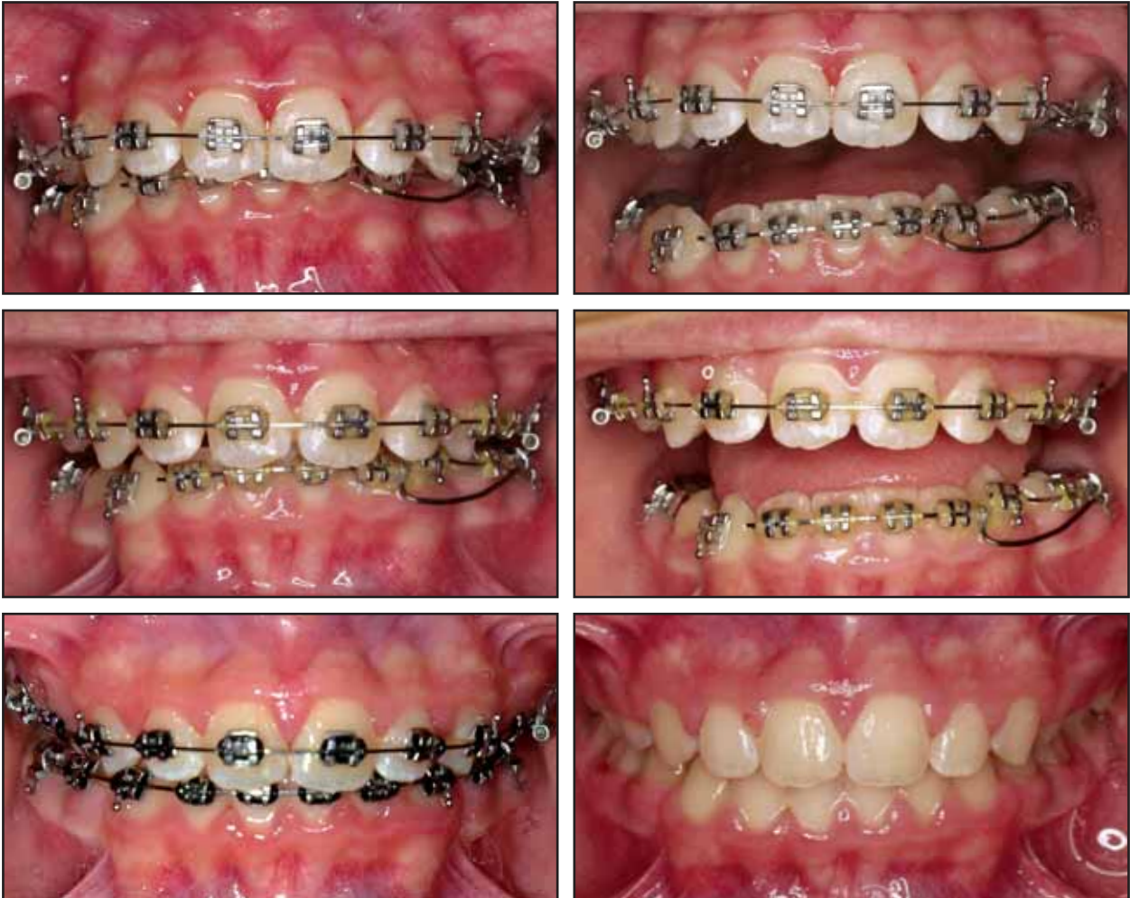
Fig. 10 Similar patient with canted lower incisal plane treated with same mechanics. Cantilever was used to correct inclination of lower incisal plane and then to intrude lower left canine (see Fig. 6).