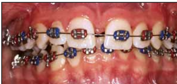
Fig. 2 Lower incisal cant evident after maxilla was expanded and initial leveling archwires were placed.