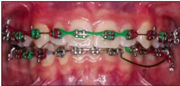
Fig. 5 Cantilever moved to distal end of lower anterior segment to produce greater anterior moment.