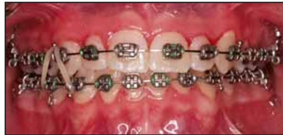
Fig. 7 Vertical elastic worn on right side to complete correction of lower incisal cant.