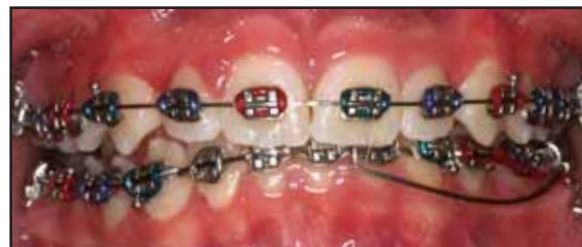
Fig. 3 Lower .016" × .022" stainless steel archwire sectioned distal to lateral incisors; .017" × .025" CNA Beta Titanium cantilever wire extended from lower left first molar to anterior segment.