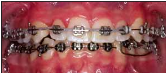
Fig. 6 Cantilever with intrusive force attached to lower left canine to correct vertical discrepancy between lower left canine and incisors.